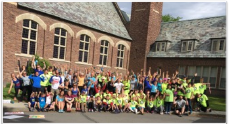
1st Annual Be Fit To Serve Race at Hutton, June 2016

We have a staff member assigned to provide ongoing case management to our alumni ages 18-24. We have alumni housing on site for those in need and we provide assistance to all Hutton children and alumni, whether 5 or 50. We provide a forever family to children who pass through our doors.